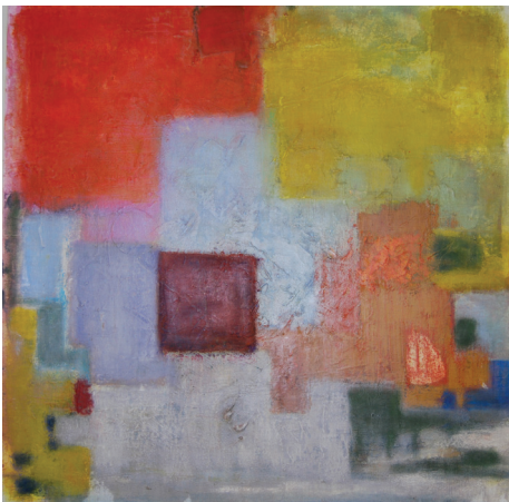
Spring I Encaustic & Oil on Canvas 24" x 24"

Exhibition Dates: March 2 - March 22, 2013